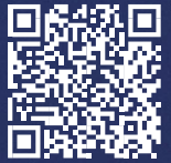
RUTX14 360° VIEW